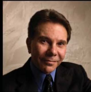
NYT Bestselling Business Author Robert B. Cialdini, PhD

“Nobody since Jane Austen has done more for persuasion than Robert Cialdini.”